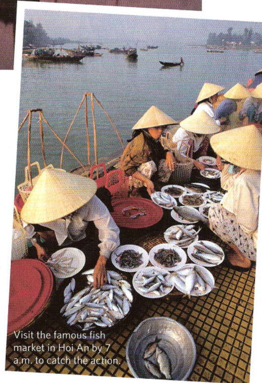
Visit the famous fish market in Hoi An by 7 a.m. to catch the action.

You can't possibly go to Vietnam without eating pho, a slow-simmered rice noodle soup topped with beef or chicken, at Pho Hoa in Ho Chi Minh City (+84-8-829-7943). In Hanoi, Cha Ca La Vong has only one dish on the menu, the cha ca, which features fried fish served over rice noodles. This one-hit wonder has earned itself major cult status among foodies all over the globe (+84-4-825-3929).