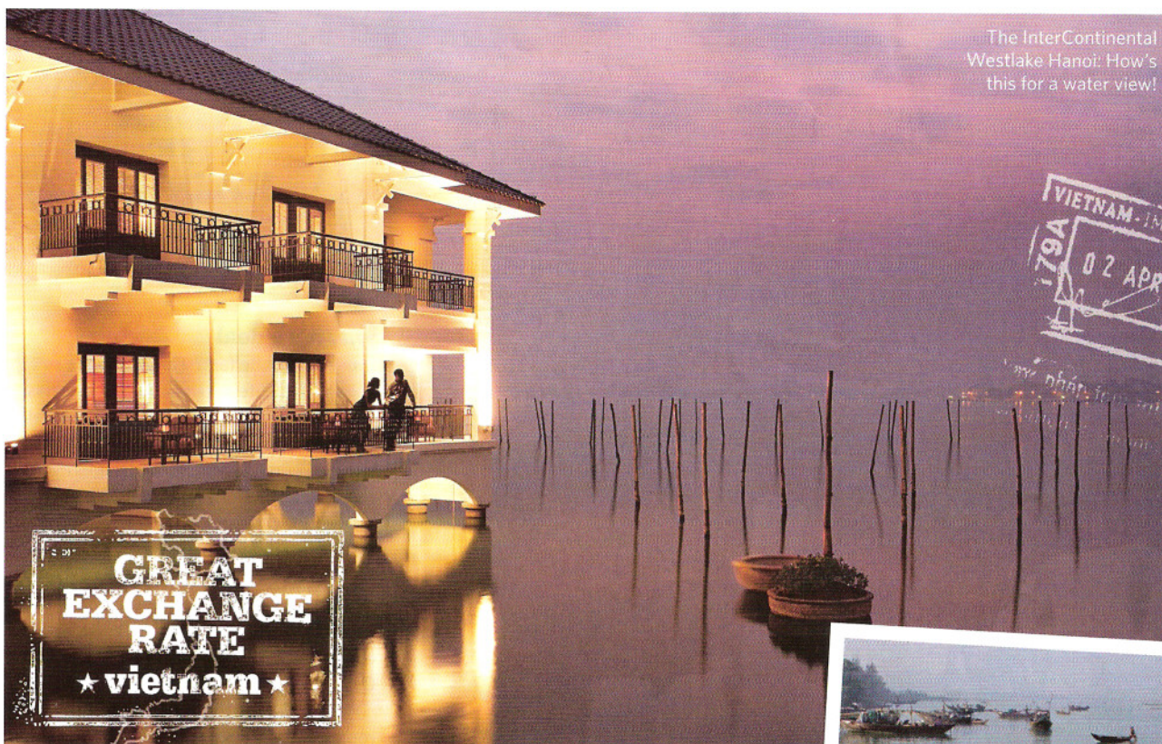
The InterContinental Westlake Hanoi: How's this for a water view!