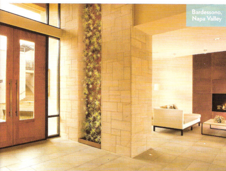
Bardessono, Napa Valley